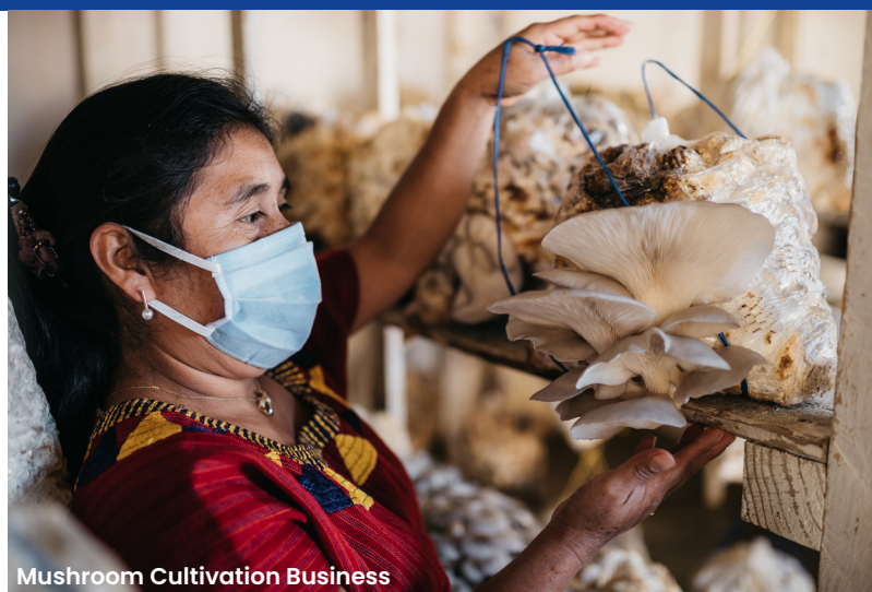
Mushroom Cultivation Business

Through participation in this program, women also receive a series of workshops on personal empowerment including gender equality, community leadership, domestic violence, reproductive health, hygiene, and nutrition. They are building self-confidence and learning to raise their voice, both in the home and in their community.