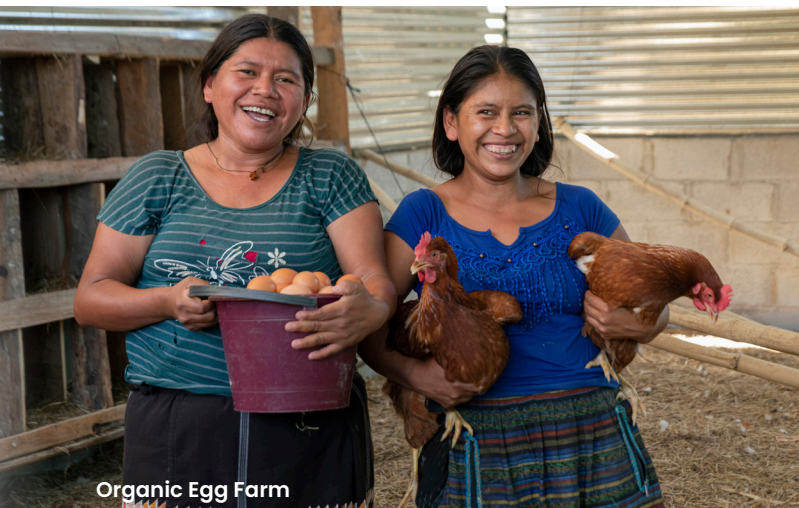
Organic Egg Farm